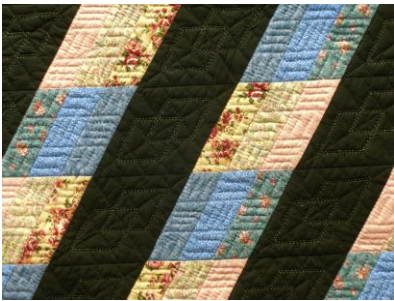
Detail image of artwork

This is the first piece in a new series based on the diamond form. Blue and pink diamonds are the most highly valued diamonds in the diamond market. This piece reflects the diamonds themselves as well as the ghost forms of the diamonds yet to be formed in the coal represented by the black areas. This artwork is heavily hand stitched to add visual as well as physical texture. It can be exhibited in several different orientations which makes it a very versatile piece.