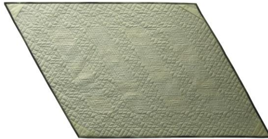
View of back of artwork