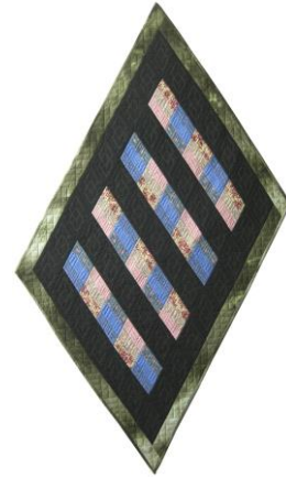
On Point orientation